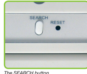
The SEARCH button