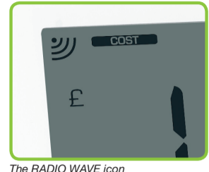
The RADIO WAVE icon

If the synchronisation process fails turn over to find out what to do