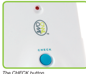
The CHECK button

You can position the Display Unit up to 30 metres away from the Sender (subject to building construction).